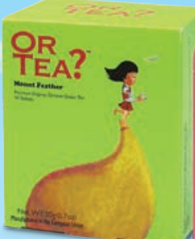
10-Sachet Box contains 10 biodegradable sachets