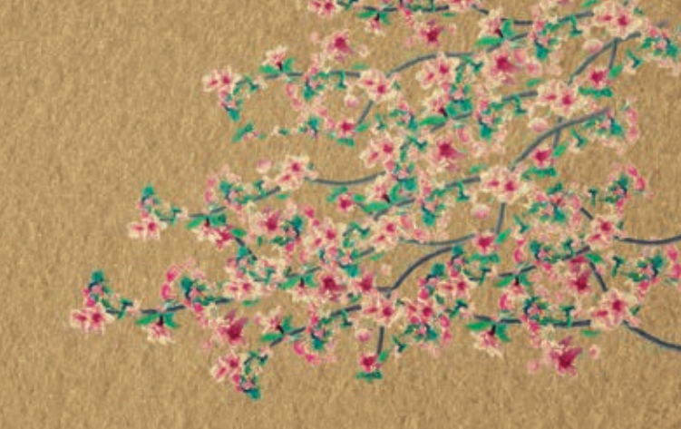
III. Warming SpecialTea