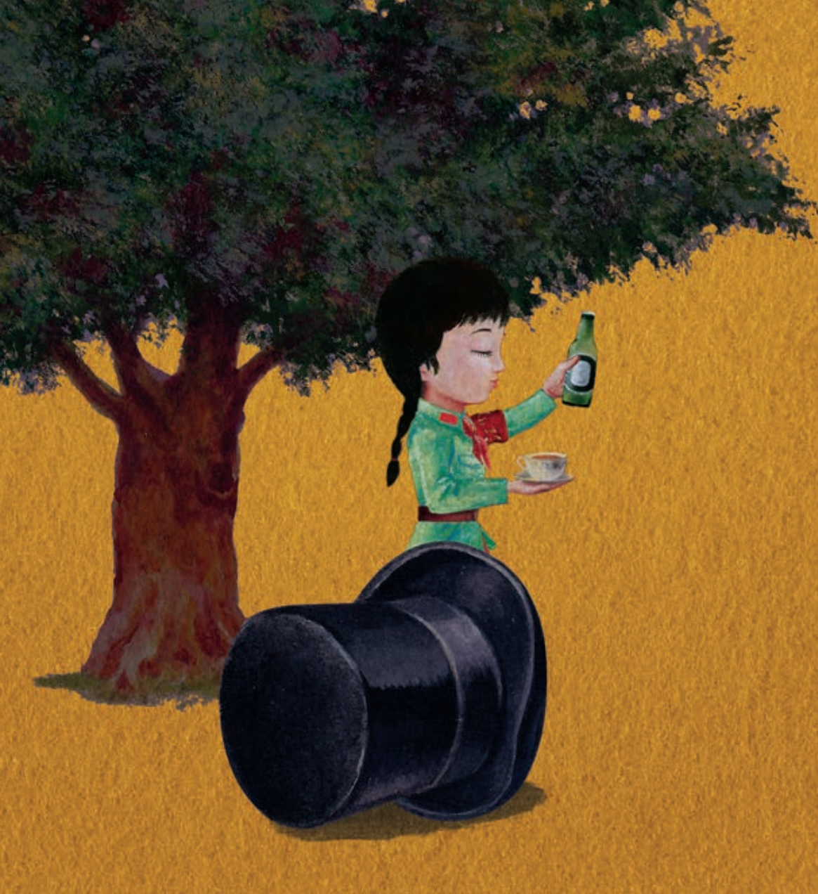
II. COLD BREWED MIXER